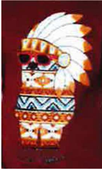
Rue 21 / 6 Two T-Shirt 14