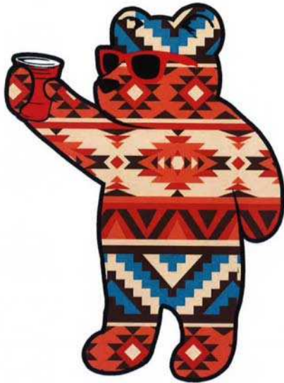
"Party Bear" 16