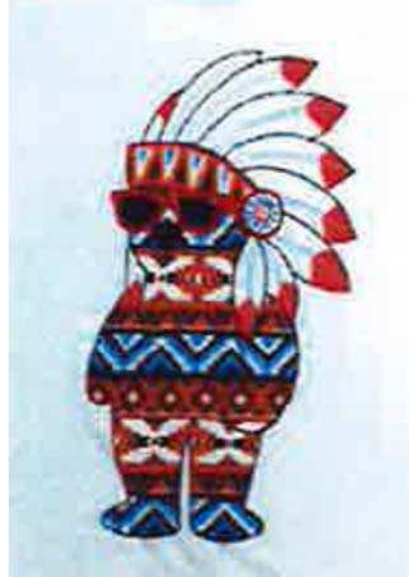
Ross Stores / 6 Two T-Shirt 15