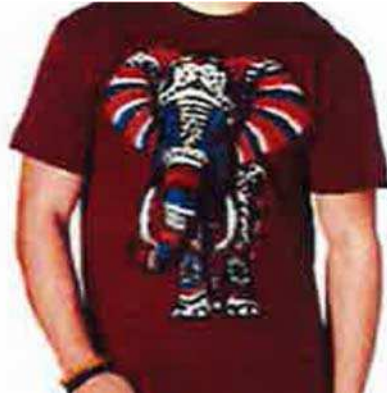
Rue 21 / 6 Two Apparel T-Shirt 18