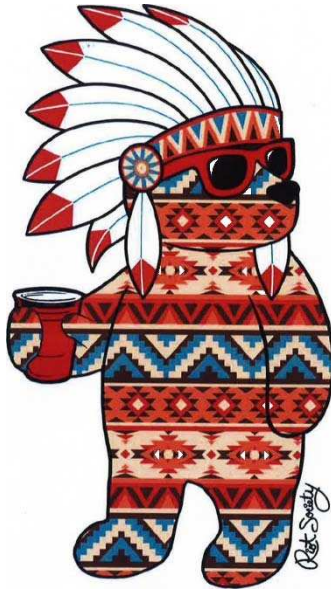
"Tribal Bear" 13