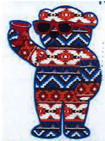
Sears T-Shirt 17