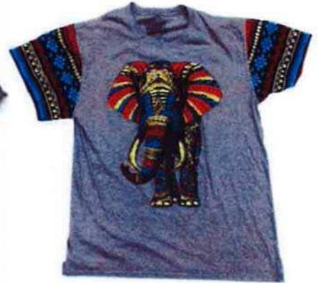
Ross Stores T-Shirt 21