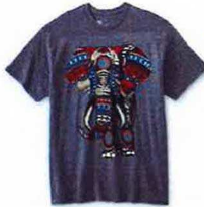
Sears T-Shirt 20