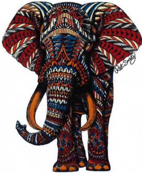
Ornate Elephant 19