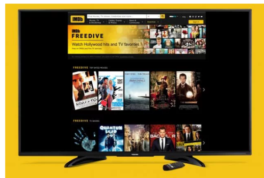
IMDb called the new video service Freedive.