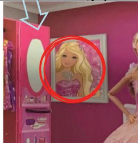
Defendant's use of the copyrighted artwork

Under the Copyright Act, a person who violates any of the exclusive rights of the owner of a valid copyright is liable for copyright infringement. See 17 U.S.C. § 106; Sony Corp. v. Universal City Studios, Inc. , 464 U.S. 417, 433 (1984). The parties do not dispute that the Copyright