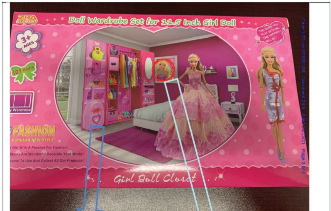
The only discernible use of the Copyrighted Barbie Artwork [ECF No. 24-5, p. 3]