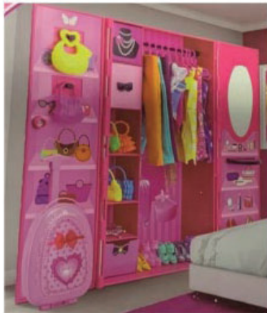
Defendant's Product - Girl Doll Closet