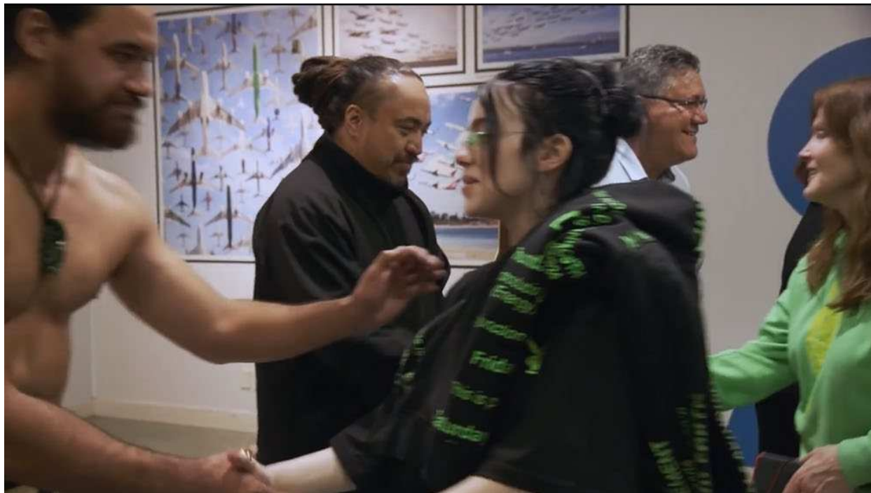
Figure 4(a), 1:34:00; 4(b), 1:34:01 12

the performance—before returning to a wide-angle shot to depict the performers in full once more. Thus, the photographs visible in this shot, too, are of de minimis use.