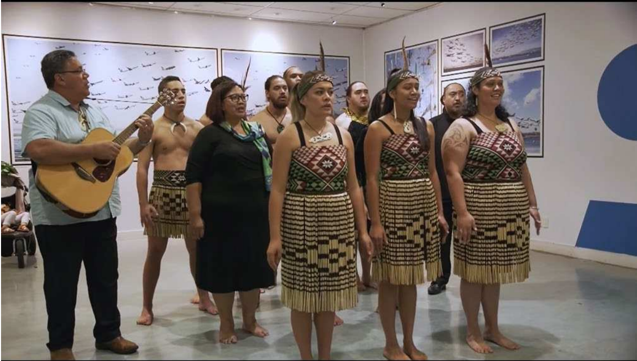
Figure 1, 1:33:24 8

In the shot captured in Figure 1, Plaintiff's photographs displayed on the back and right-side walls of the exhibit are visible. These include—on the back wall, from left to right—Compl. Exs. E and F; and—on the right wall, from left to right, moving clockwise—Compl. Exs. G, H, I, and J. Analyzed under the Ringgold factors, see Ringgold , 126 F3d at 75, the photographs marked in the complaint as Exs. E and F are each observable for approximately three seconds; they appear in the background, at a distance, and out of focus. See Figure 1. Approximately half of Ex. E is obstructed by the performers, who stand blocking much of the bottom half of the photograph; and the majority of Ex. F appears obstructed by the performers, standing in front of and blocking most of it. Id. This degree of obstruction militates in favor of a finding of de minimis use of Exs. E and F in this shot. See Gottlieb Dev. LLC , 590 F. Supp. 2d at 632; LMNOPI , 449 F. Supp. 3d at 92. Additionally, in this shot, Ex. F is hardly discernible to a lay observer as a photograph of airplanes at all, let alone