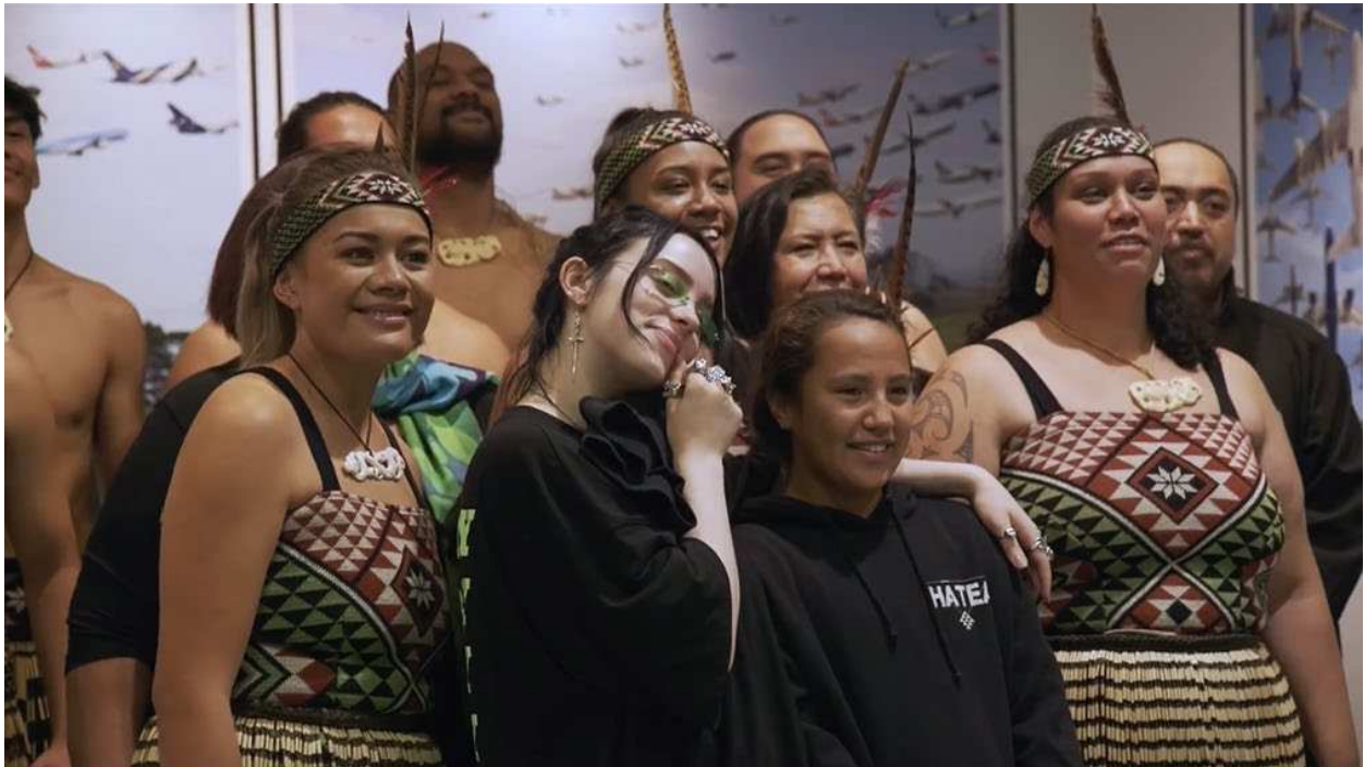
Figure 5 1:34:03 13

The photographs visible in Figure 5 are hardly recognizable as the Plaintiff's photographs at all. On the back wall, Compl. Ex. E (left side) is observable here for approximately one second; the majority of Compl. Ex. E appears out of frame, it is partially obstructed, in poor lighting, out of focus, at a distance, and in the background. In these conditions, this photograph is indiscernible to