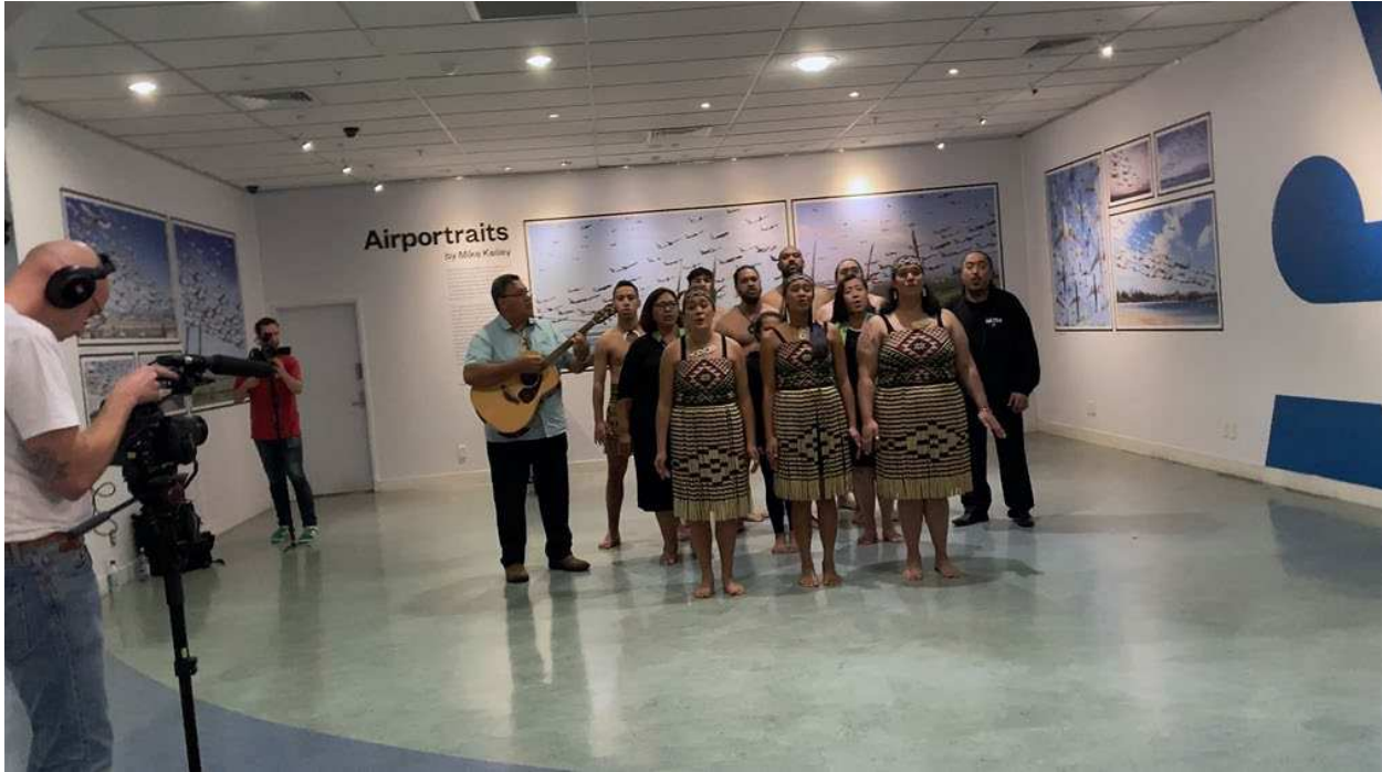
Figure 2, 1:33:33 9

As Figure 2 shows, all three walls of the exhibit are in view in this shot, with the exhibit again comprising the background of the scene. The left wall is now visible, featuring Compl. Exs. A (top left corner), B (lower left corner), C (far right), and D (second from the lower left). On the left wall in this shot, Compl. Exs. A, B, C, and D are each observable for approximately one second; they each appear in the background, at quite a distance, in poor lighting, and on a sharp angle. None of the left-wall photographs in this shot are readily recognizable as Plaintiff's; they are each either partially obstructed (Compl. Exs. A, B, and C) or almost totally obstructed (Compl. Ex. D) by the camera operators and their equipment. Compl. Exs. B and D, in particular, are almost totally indiscernible in this shot. See the Film, at 1:33:33–34. Again, similar to the work in Sandoval , 147 F.3d at 218, observability weighs in favor of de minimis use for the photographs marked Compl. Exs. A, B, C, and D in this shot.