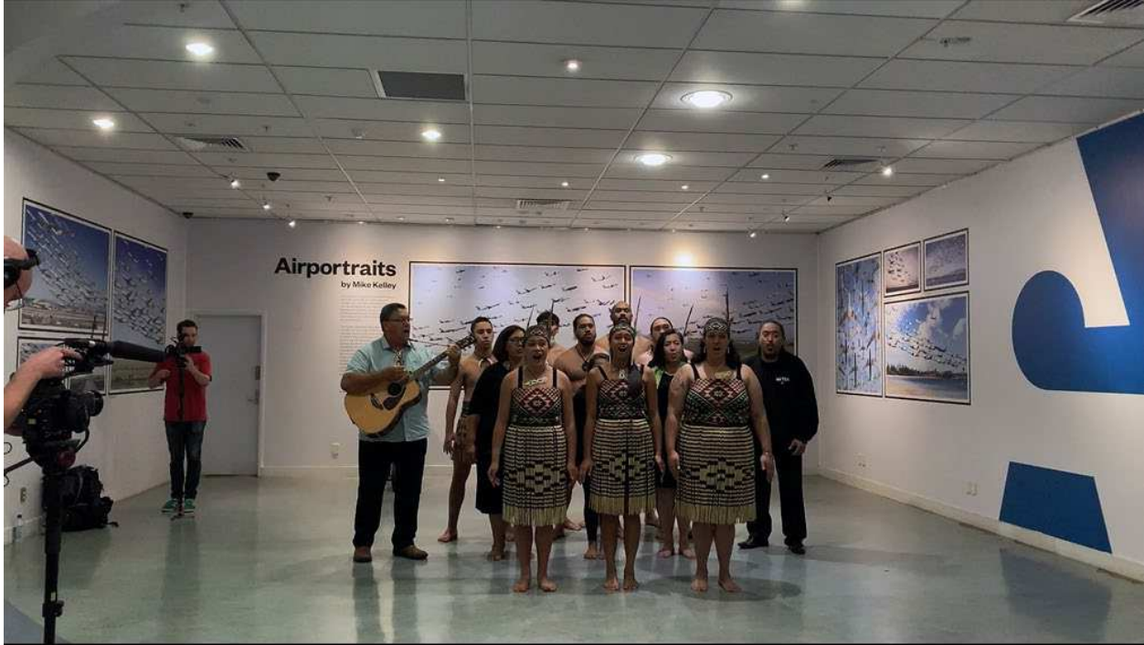
Figure 3, 1:33:41 10

The third shot, represented by Figure 3, is almost identical to the view we have of the photographs in Figure 2. 11 The same observability conditions, see Ringgold , 126 F3d at 75, are present with respect to each photograph’s degree of obstruction, lighting, focus, camera angles, distance, and presence in the background of the shot—except the photographs in this shot are visible for six (in the case of Compl. Exs. A, B, C, and D) to eight (for Compl. Exs. E, F, G, H, I, and J) continuous seconds at a time. See the Film, at 1:33:37–45. Though this shot contains a lengthier depiction of each photograph, it remains clear that the photographs are not the focus of the scene; the focus is the performance of Eilish’s song for her, and Eilish’s reaction thereto. Cf. LMNOPI , 449 F. Supp. 3d at 91. Indeed, the shots represented in Figures 2 and 3 are broken up by a three-second intermission wherein the camera pans to Eilish and her family members to capture their reactions to