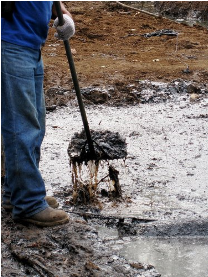
The Pollution Chevron Left Behind...Shushufindi pit 38. Chevron's scientists found no contamination at this pit.