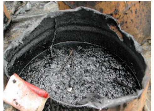
The Toxic Waste Chevron Left Behind In Ecuador