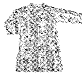
Goodnight Lulu Geraniums Bath Robe- All Cotton