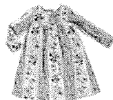
Goodnight Lulu Geraniums Girls Nightgown- All Cotton