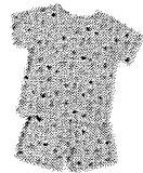
Goodnight Lulu by Baby Lulu Prince Charming Shortie Pajamas - Girls Cotton Pajamas

Price $39.00 Special $15.60 You Save 60%