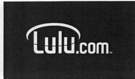
EXHIBIT tabbles 119 YOUNG 10.5.07