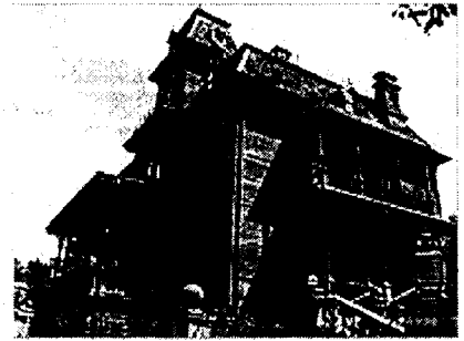
Phantom Manor in Disneyland Paris is an example of a haunted attraction.

A haunted attraction or dark attraction is a venue which simulates the experience of visiting a structure or outside space that is inhabited by what appear to be supernatural beings—such as ghosts or entities. They can also be venues featuring other frightening subjects such as crazed animals or escaped murderers. The illusion—created by actors, animatronics, theatrical sets, sounds, lighting, and other special effects—is designed to frighten patrons who typically purchase tickets for the privilege. These events are open to the public and commonly held throughout the month of October, leading up to Halloween. However there is a small sub-set of dark attractions that are open all year long. Over the years, dark attractions have expanded their scope beyond the "haunted house" format to include any place that is either ominous or foreboding, such as abandoned factories, old prisons or early 1900s-era hospitals/asylums.