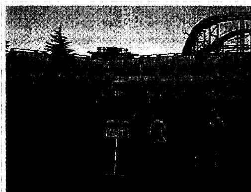
The Haunted Hospital at Fuji-Q Highland amusement park, the largest haunted attraction in the world

A trio of zombies from a haunted attraction featuring live actors in simple costumes and makeup, rendering a deceased "Bloody Skull Face" look, featuring blacked-out eyes and stage blood.