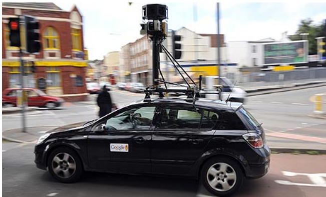
A Google mapping car with which the web giant admits accidentally collecting wifi data.