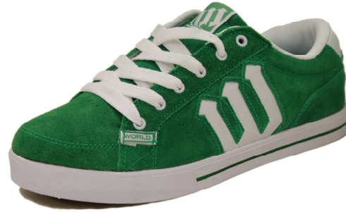
World Industries' Knock-Off