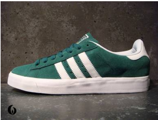
adidas Campus Vulc