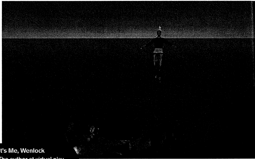
AVATAR ATHEM NG

But a week is enough time to see that for all its irritating clunkiness, Second Life is intriguing. There are elaborately designed temples on Svarga, the experimental weather simulator built by the National Oceanic and Atmospheric Administration, and an exact model of a planned Starwood Hotel. Given another generation or two of technology, homebuilders, architects, and interior designers might create photorealistic buildings and rooms, easy to change, that will smooth real-world projects. Retailers could go from today's two-dimensional websites to full three-dimensional stores that would give consumers more natural ways to shop while online. You could go see your favorite band "live." I like my world, but I can see why I might want to spend time in a virtual one. —M.F.