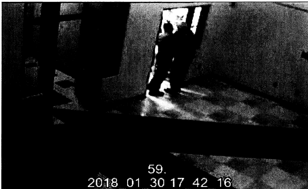
Figure 2: Korb and Hastings interact in the door frame

recording. The video shows that Korb interacted with Hastings near the doorframe for approximately ten seconds (7:43 until 7:53).