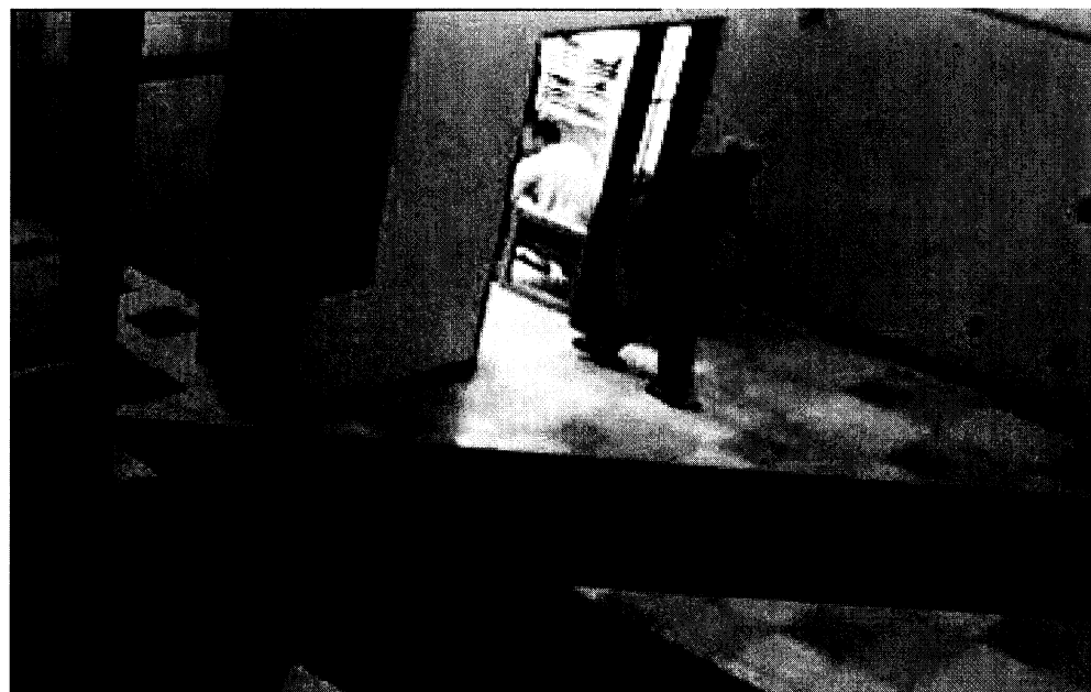
Figure 3: Korb exiting the unit office