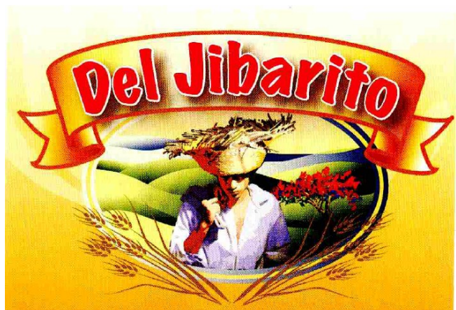
Orion DEL JIBARITO label variants. (Docket No. 22-3).