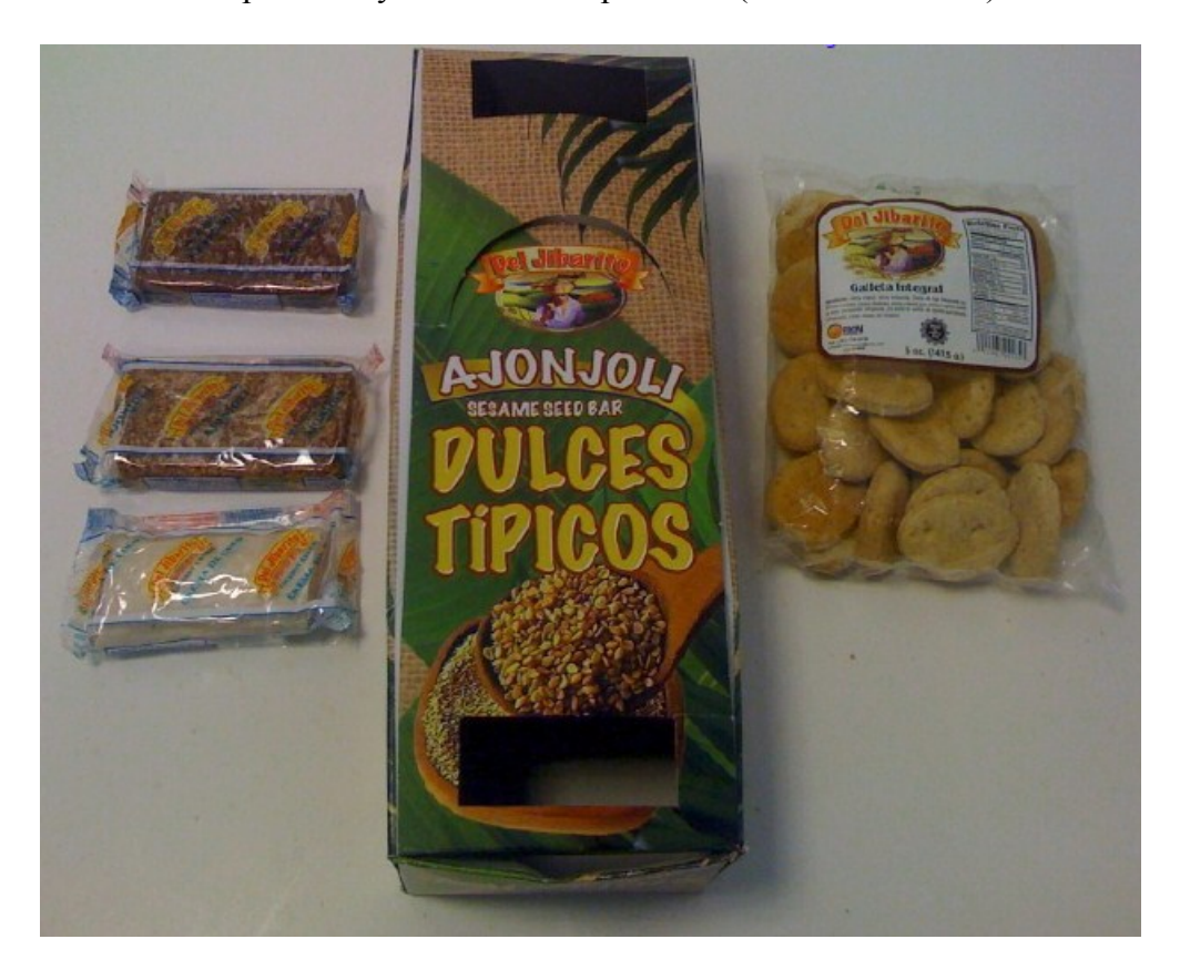
Samples of Orion DEL JIBARITO products. (Docket No. 22-5).