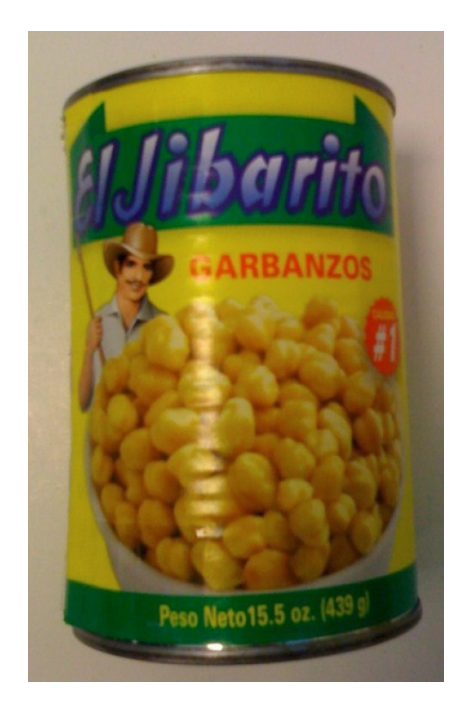
Sample of Goya EL JIBARITO product. (Docket No. 22-7).