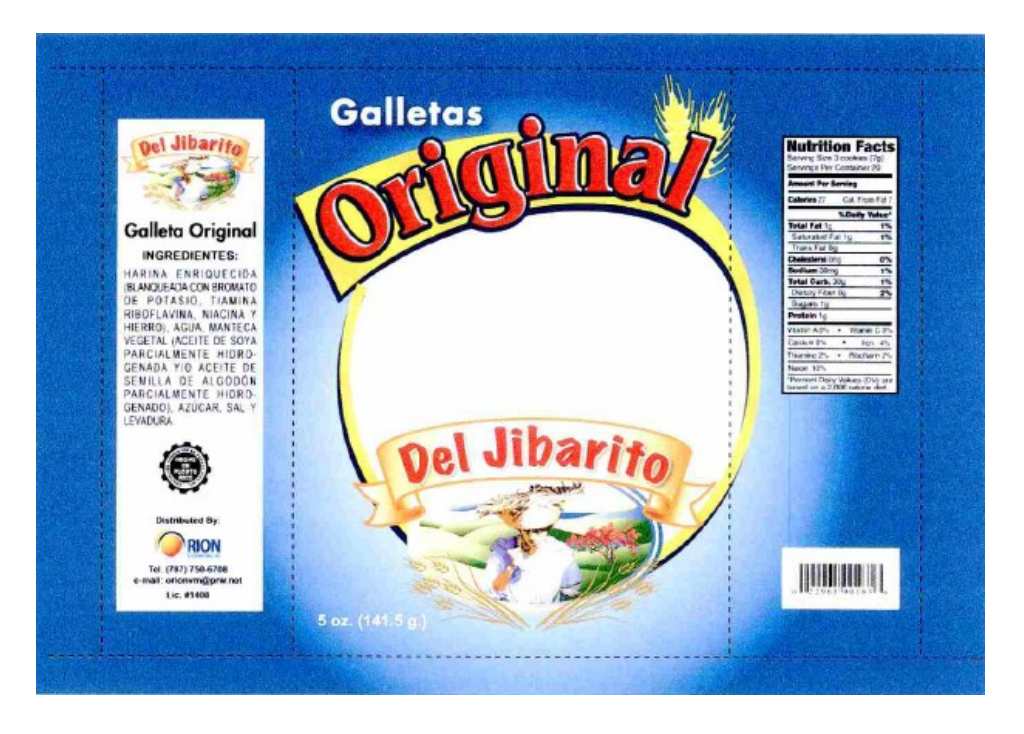
Example of Orion DEL JIBARITO packaging. (Docket No. 22-6, p. 4).