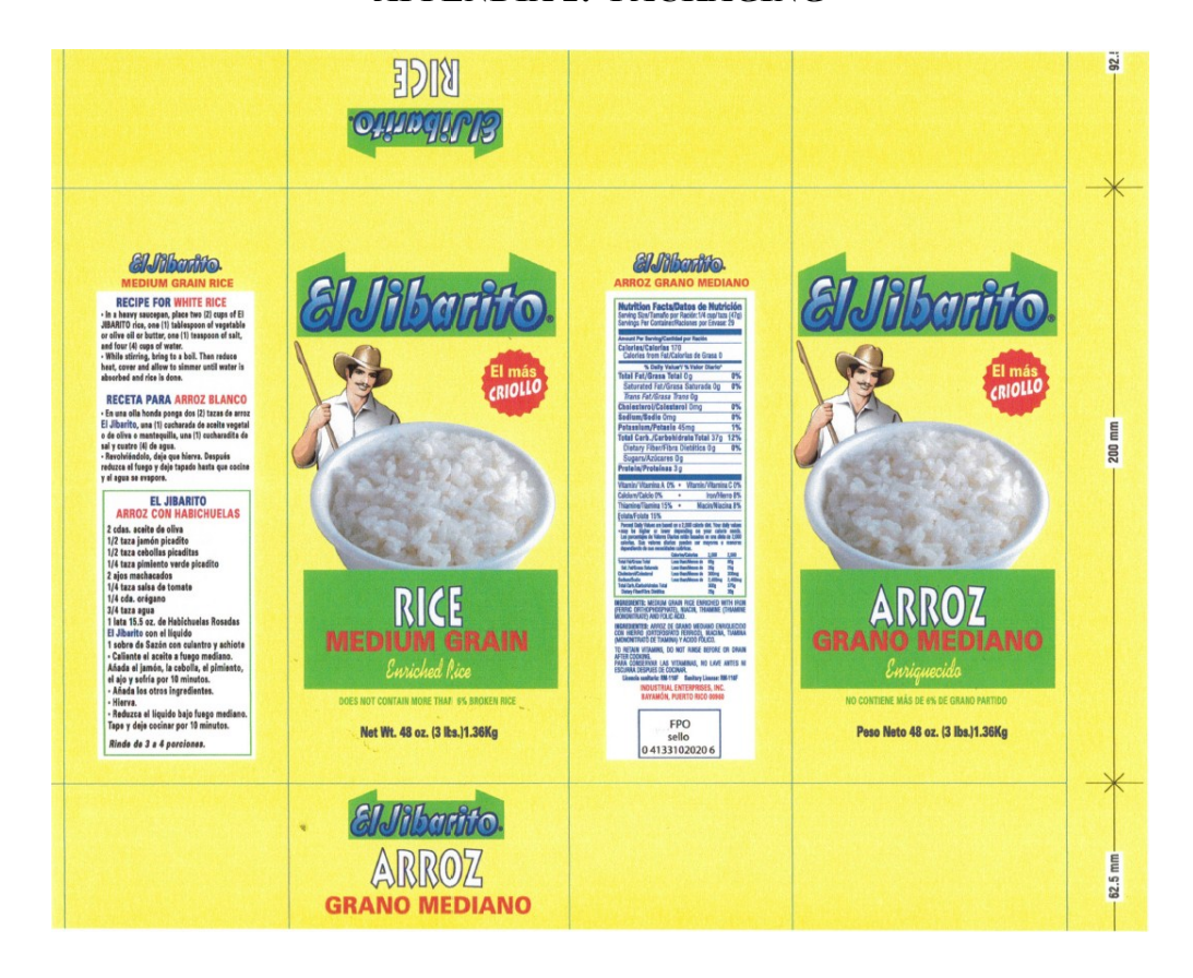
EL JIBARITO rice packaging. (Docket No. 22-4, p. 2).