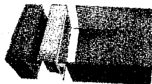
Wall Unit New Tub Old Tub