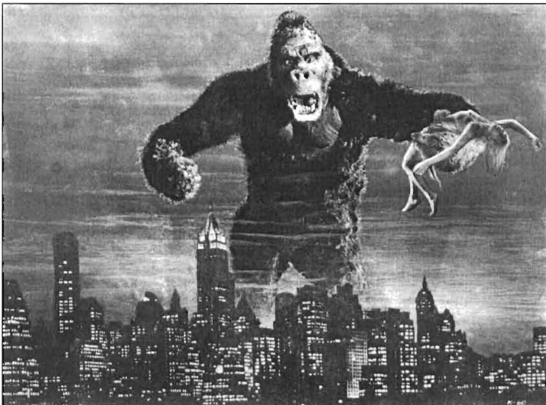
King Kong (RKO Radio Pictures 1933 (promotional poster)).

captivity, kidnapped a white woman, and went on a murderous rampage. The racialized imagery associated with King Kong has long been recognized. Indeed, the original German version of the movie, released in 1933 Nazi Germany, carried the title that translated to “King Kong and the White Woman.” See Thomas E. Wartenberg, Humanizing the Beast: King Kong and the Representation of Black Male Sexuality, in Classic Hollywood, Classic Whiteness , 157, 157–58 (Daniel Bernardi, ed. 2001). Further, the placing of a sign that read “King Kong lives” near an African American employee’s workstation and calling him “a monkey, a boon, an ape [and] a gorilla” were among the referenced conduct that supported a punitive damage award in a racially hostile workplace case. Turley v. ISG Lackawanna, Inc. , 960 F. Supp. 2d 425, 433–34 (W.D.N.Y. 2013).