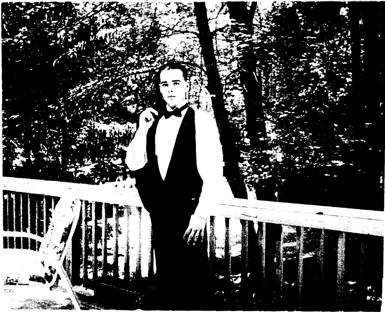
This is me before O.J. Simpson Terrorized my life