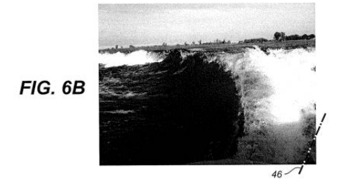
U.S. 9,260,161, FIG. 6B

"Where there is a material dispute as to the credibility and weight that should be afforded to conflicting expert reports, summary judgment is usually inappropriate." Crown Packaging Tech., Inc. v. Ball Metal Beverage Container Corp., 635 F.3d 1373, 1384 (Fed. Cir. 2011). Here, the parties have proffered relevant and competing expert testimony on whether the Surf Tabs of the MasterCraft Gen 1 suffice to meet the functional limitations — particularly the "substantially smoother" requirement — of the Allegedly Anticipated Claims. Accordingly, summary judgment is DENIED because a reasonable jury could find that the MasterCraft Gen 1 does not anticipate.