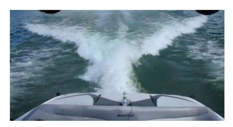
2010 MY MasterCraft X2, Port and Starboard Ballast Full, Starboard-side Surf Tab Deployed

Breen includes the following photograph as evidence that "[w]hen equally weighted and with either port or star-board side Surf Tabs deployed, the wake produced behind the 2010 MY MasterCraft X2 featured significant amounts of white water on the lip without a clean face or a height that is suitable for surfing as shown in the screenshot below." (Id. at PageID 5560.)