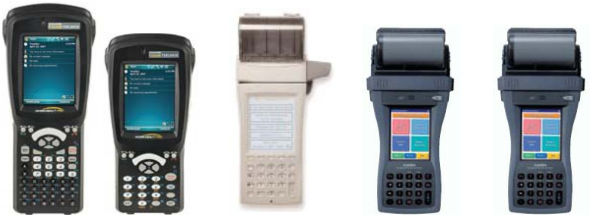
Pison Workabout Pro

Workabout Pro, Fujitsu TeamPad 500, Casio IT 3000, and Casio IT 3100. All of the devices have display screens that are rigidly mounted in their housing: