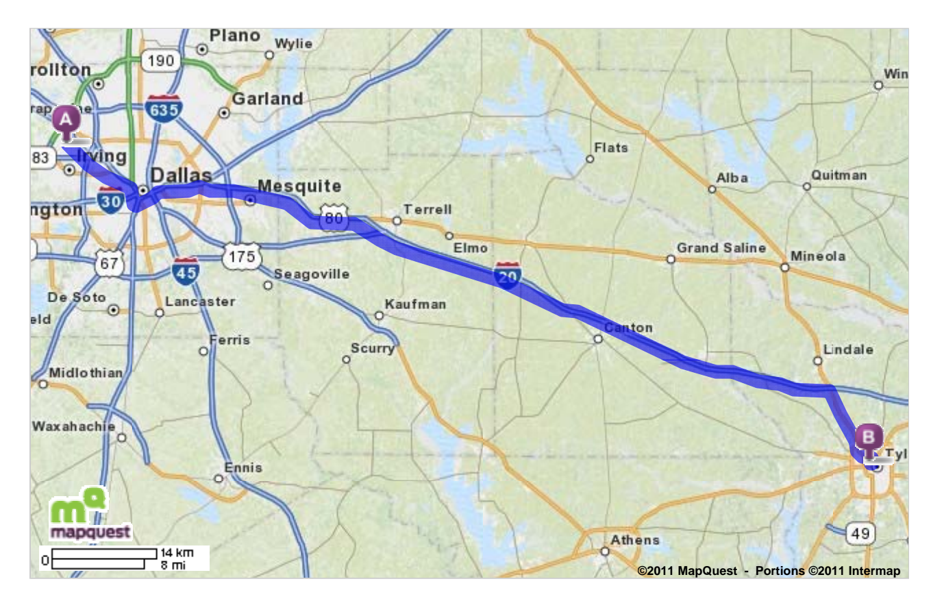
All rights reserved. Use subject to License/Copyright

Directions and maps are informational only. We make no warranties on the accuracy of their content, road conditions or route usability or expeditiousness. You assume all risk of use. MapQuest and its suppliers shall not be liable to you for any loss or delay resulting from your use of MapQuest. Your use of MapQuest means you agree to our <u>Terms of Use</u>