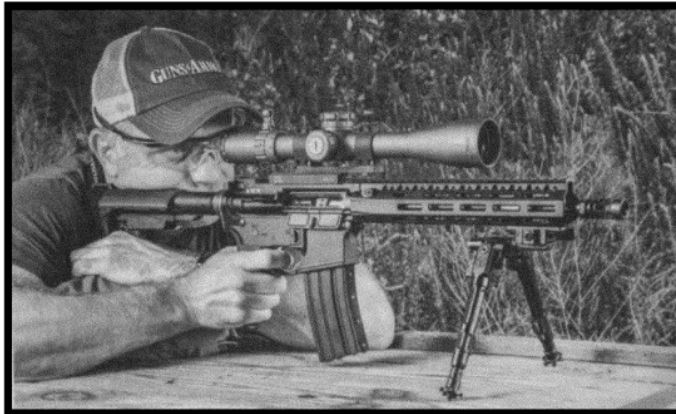
Figure 3. Marketing photo of Reece 11 MCMR 5.56 NATO caliber pistol with SBA3 stabilizing brace. Defs' Hearing Slide 18 (depicting picture in Final Rule at 6,546).

The example of the community use factor featured at the evidentiary hearing also shows there are at least some circumstances in which this factor has an understandable meaning. Doc. 106, Hearing Transcript, 54. The example, a YouTube video with 159,654 views and 235 comments, captures two firearm enthusiasts discussing brace-equipped firearms and demonstrating how a brace-equipped pistol can be fired from the shoulder. Defs' Evidentiary Hearing Slides at 19 (embedding link to video cited in Final Rule at 6,509 n.94); Doc. 106, Hearing Transcript, 54 (explaining community use factor goes to the same inquiry of whether a weapon is fired from the shoulder).