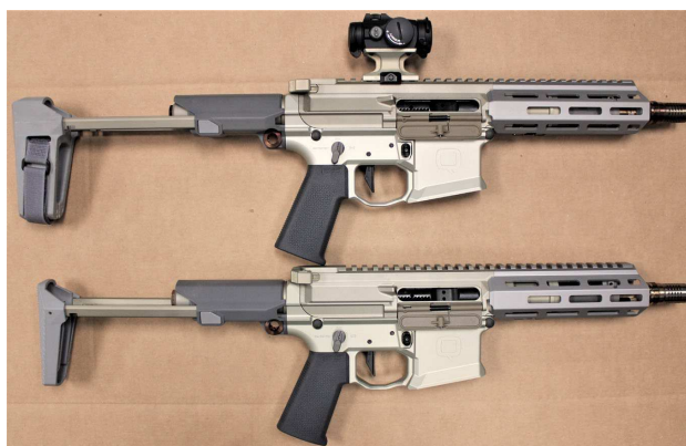
Figure 2. Contemporaneously marketed heavy pistols equipped with a “stabilizing brace” (top) compared with contemporaneously marketed rifle by same company (bottom). Final Rule at 6,494.

To respond to this trend in manufacturing and consumer use, as well as its varied classifications, the ATF published a notice of proposed rulemaking (“Proposed Rule”) in June 2021. 86 Fed. Reg. 30,826. The Final Rule was published on January 31, 2023. 88 Fed. Reg. 6,478. The Final Rule amends the definition of “rifle” under ATF regulations, which address the ATF’s meaning for the term “rifle” in the NFA and GCA. 27 CFR §§ 478.11, 479.11. The Final Rule sets up a multi-factor criterion by which the ATF determines whether a brace-equipped firearm is