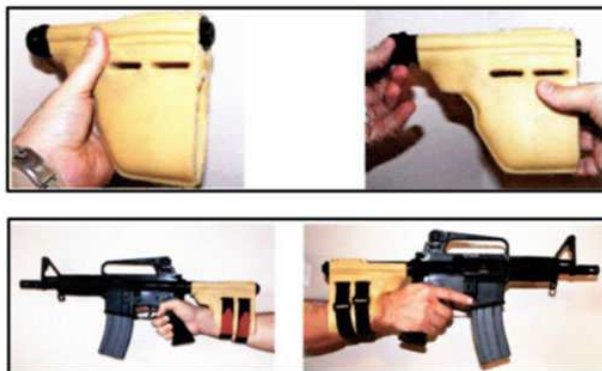
Figure 1. The “forearm brace” prototype of 2012, which the ATF did not classify as a short-barreled rifle. Final Rule at 6,483.

functional SBRs that avoided NFA requirements for SBRs, thereby allowing consumers to fire the brace-equipped firearms from the shoulder. Final Rule at 6,503, 6,527, 6,545–48.