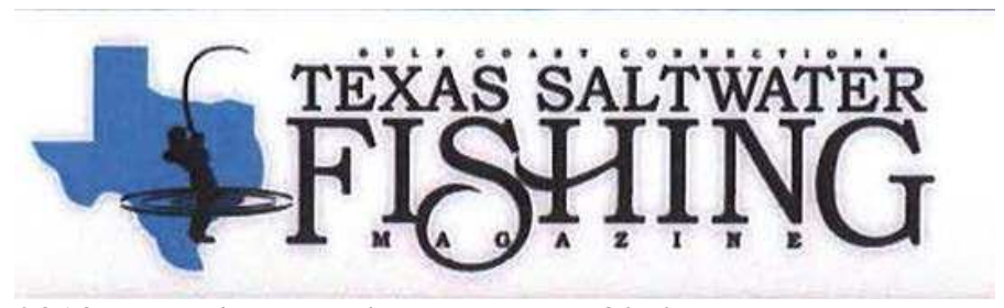
2010 nameplate. Docket Entry No. 32-4.

nameplate differed from the previous version in several notable ways. Among other changes, the sunrise from the 2006 Nameplate was replaced with a plain background, and the images of the fishers and a fish at the margins of the 2006 nameplate were removed. Additionally, in the phrase "Texas Saltwater Fishing," the words were no longer the same size—"Fishing" was now double the size of "Texas and "Saltwater." The 2010 nameplate is still displayed on current print issues of TSF Magazine.