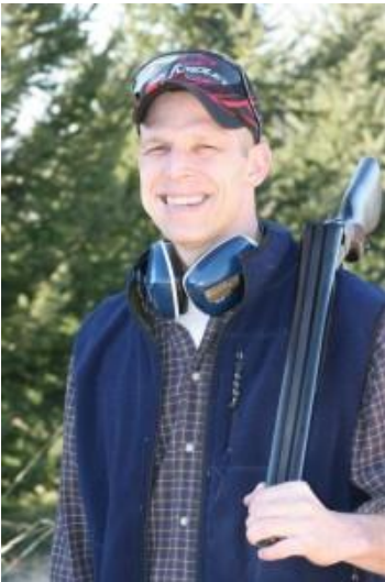
[Politics PA, 4/25/12 ]