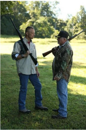
[Scott Perry Campaign Website, Accessed 9/18/19 ]