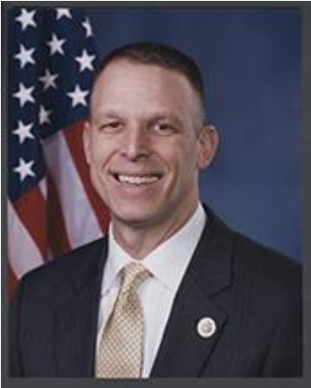
[Scott Perry, Congressional Biography, accessed 9/18/19]