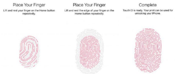
ECF No. 1, Ex. I at 16.

The parties dispute claim construction. Defendant argues “at least one of” modifies only “the number of said entries.” ECF No. 23 at 13-14. In other words, the claim requires least one entry in