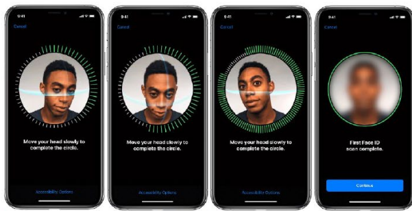
ECF No. 1, Ex. H at 11.

The infringement contentions attached to the complaint plausibly show that the accused product will determine and store only the number of said entries. ECF No. 23 at 7 (reproducing contention showing three face images), 8 (reproducing contention showing three fingerprints). The accused products will “receive a series of face images” and “populate the database of biometric signatures.” Id. at 7 (reproducing contentions). The accused product also “receives a series of fingerprint signal[s] ... to set up a Touch ID.” Id. at 8 (reproducing contentions). Plaintiff provides similar contentions for both the '705 Patent and '208 Patent. Id. at 9. Plaintiff argues that the accused products determine (establish) a number of biometric data entries in a series sufficient for enrolling a user’s biometric data. ECF No. 25 at 11.