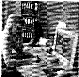
Many sites showcase people making as much as $300 a day working online from home on their computer.

AS SEEN ON: abc AOL CNN M 4 11 NBC USA TODAY