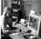
Many sites showcase people making as much as $300 a day working online from home on their computer.