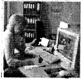
Many sites showcase people making as much as $300 a day, working online from home on their computer.