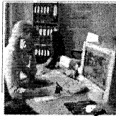
Many sites showcase people making as much as $322 a day working online from home on their computer.