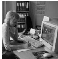
Many sites showcase people making as much as $300 a day working online from home on their computer.