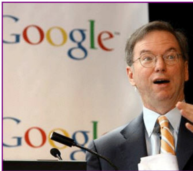
Google CEO announces Google Adwork . A new public advertising program that will employ as many as 10,000 at home workers and pay $30,000 - $75,000 a year.

Google's CEO Larry Page says the innovative initiative will benefit his company and average people as well. "We know that times are hard right now and hiring this pool of online workers will not only allow thousands of Americans to earn a healthy salary from home, it will help Google do our job more thoroughly."