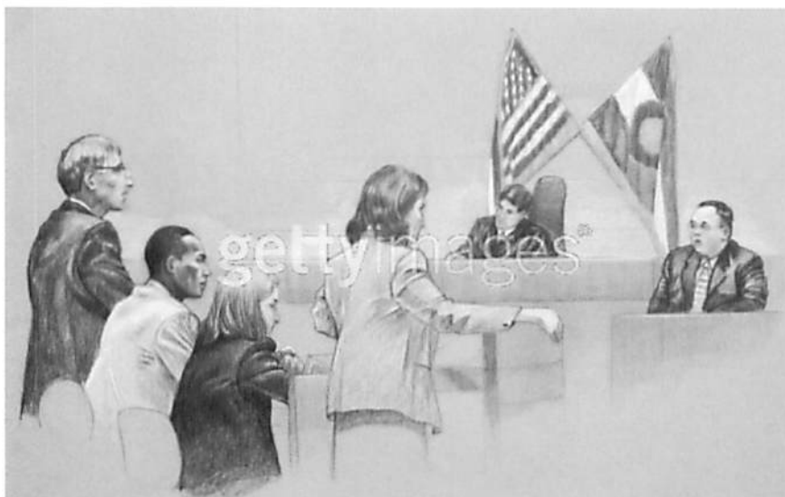
Title: Kobe Bryant Returns To Court In Eagle Colorado