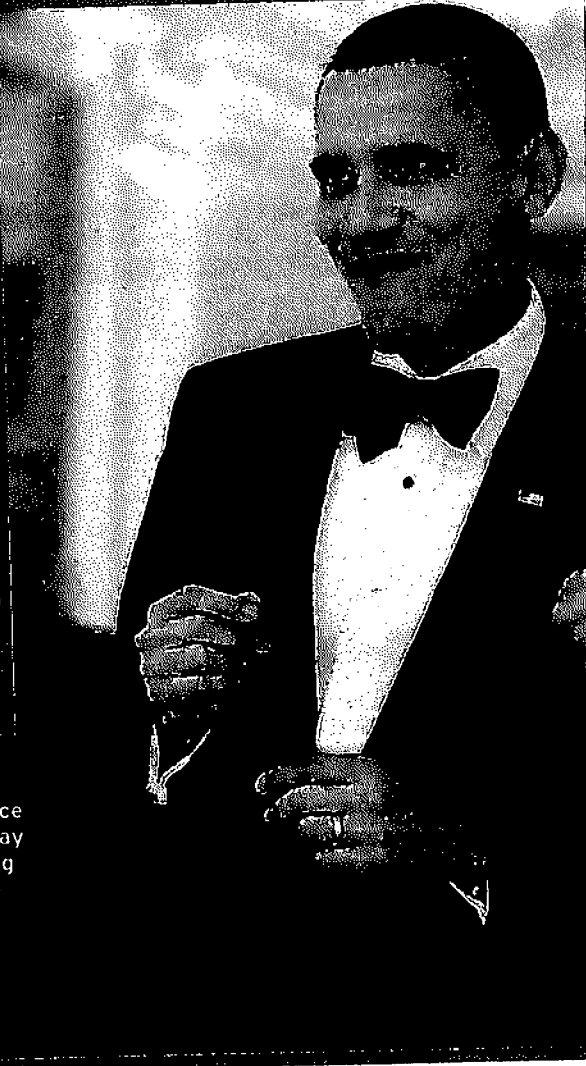
Obama and Michelle dance the night away at a glittering White House party