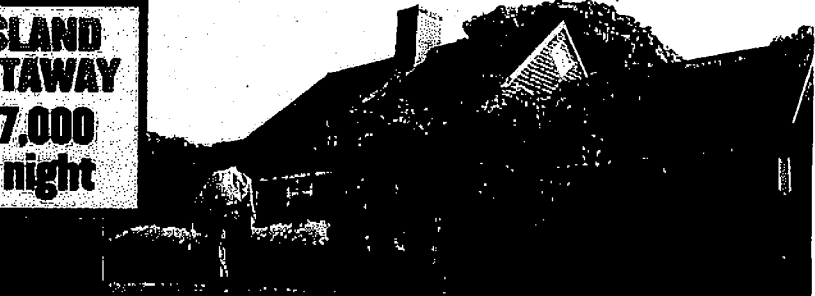
The President takes a stroll on the spacious grounds. He and the wife and kiddies stayed inside this megabucks house on Martha's Vineyard