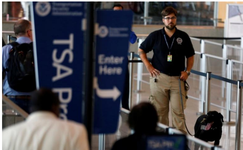
A TSA security officer and his dog scan departing passengers at Lindbergh Field airport in San Diego, California, U.S. July 1, 2016.

U.S. green card holders will require additional screening before they can return to the United States, the White House said on Saturday.