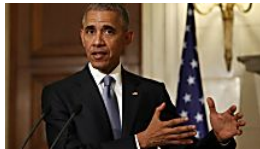
Obama: Clinton would have won in a landslide...