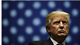
Hawaii restaurant tells Trump voters to eat...