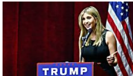
Ivanka Trump quoted in '06 as saying: 'If he...

TAGS DONALD TRUMP KATRINA PIERSON 2016 GOP PRIMARY MUSLIM BAN