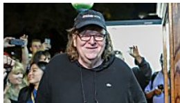
Michael Moore tells Trump and 'Pencey...