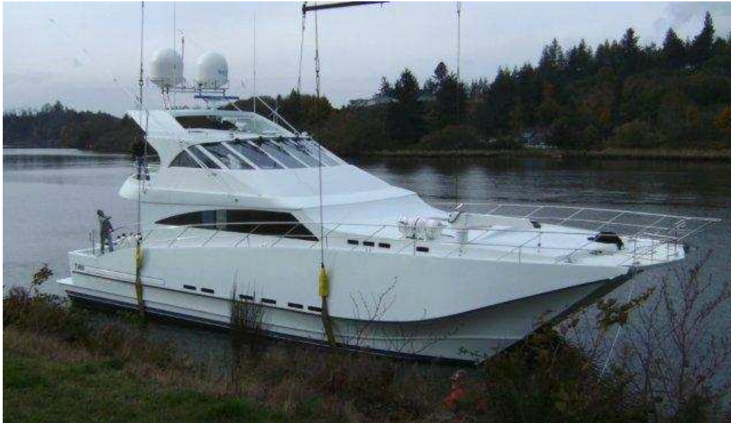
12 Little Goose