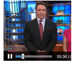
John Oliver on Trump: 'How [expletive] did we get here'