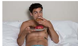
The Absolute Best Sheets You Will Ever Find. Period.