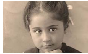
10 Classic Baby Girl Names That Are Ready to Make a Comeback Ancestry