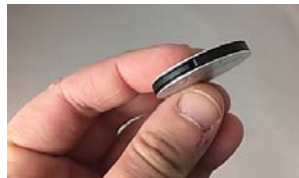
The must-have spy device every car owner needs to possess Techie Fans