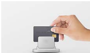
Shopify Takes on Square With New Credit Card Reader Tech