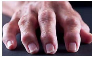
Find Out What Really Causes Psoriatic Arthritis Yahoo! Search