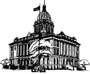
CIRCUIT COURT BRANCH III

MANITOWOC COUNTY COURTHOUSE 1010 SOUTH 8TH STREET, P.O. BOX 2000 MANITOWOC, WISCONSIN 54221-2000