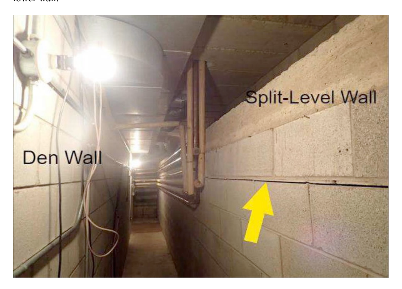
Id. at 4, 11. The report further notes that, in addition to the crack, the blast caused the wall to lean and bow toward the den wall. Based on observations made during its inspection, as well