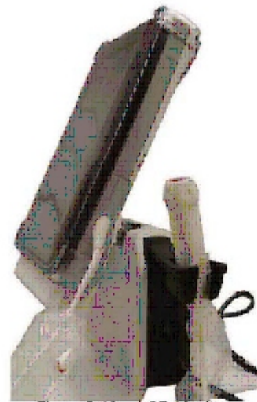
Figure 2-18. LCD Monitor

The Venue 40 console is operated with a touch stylus that is not part of the contents of the beamformer or transducer enclosures. It is secured to a docking station during operation. Power to operate the system is provided via the docking station cord, which is plugged into an AC power source or in certain instances, via a battery module. A battery module avoids powering the system down between dockings, to provide power in the event power from the dock is interrupted and for limited emergency uses when no dock is available. Below is a diagrammatic representation of the configuration of the components of the Venue 40, the console with attached stylus and probe in the docking station: