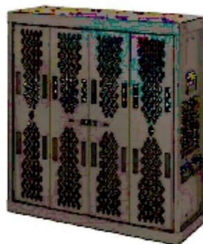
Marvel weapons cabinet

These designs are very similar, almost indistinguishable. Defendant cannot argue plausibly that plaintiff's original infringement contentions were weak.