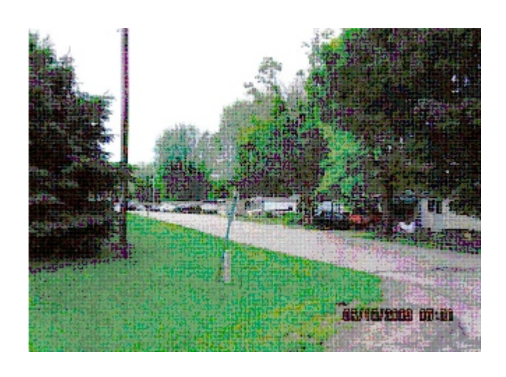
Plaintiffs' Property and Neighborhood

Boardwalk prepared an appraisal for "the amount of the loan," even though they knew that was not the fair market value of the property. To inflate the appraisal, defendants used "comparable" homes that were larger, conventionally constructed (plaintiffs had a modular home), in different types of neighborhoods and as far as nine miles away. Plaintiffs' property and the "comparable" properties are shown below: