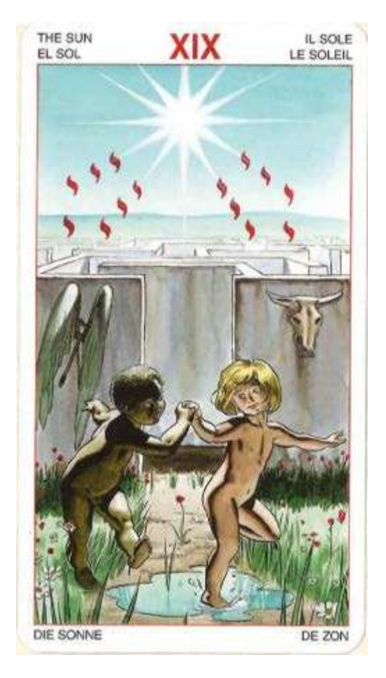
Dkt. 74, at 1, 3.

At least some of the objected-to cards would fall within the definition of "pornography" used by the DOC. Division of Adult Institutions (DAI) policy 309.00.50 prohibits "inmates from possessing pornographic materials." Dkt. 50-1, at 1. Pornography is defined in this policy somewhat flexibly, through a list of non-exclusive examples. In pertinent parts, the definition provides: