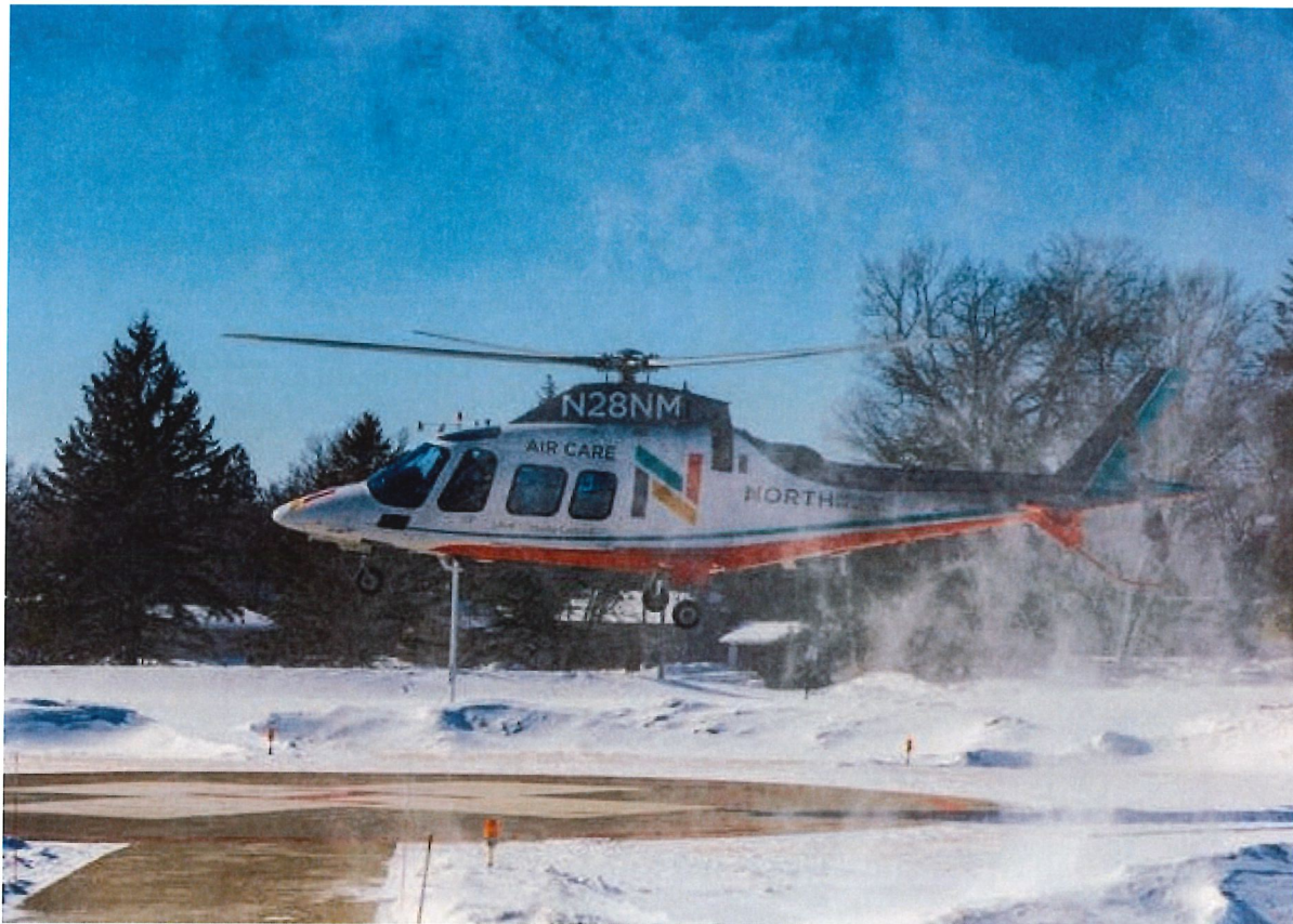
A helicopter arrives to transport a COVID patient to another facility on Feb. 2 at Riverwood Healthcare Center in Aitkin, Minn.

“We're always optimistic, but then it seems like the ripple comes back,” she said. “So hopefully, hopefully it is.”