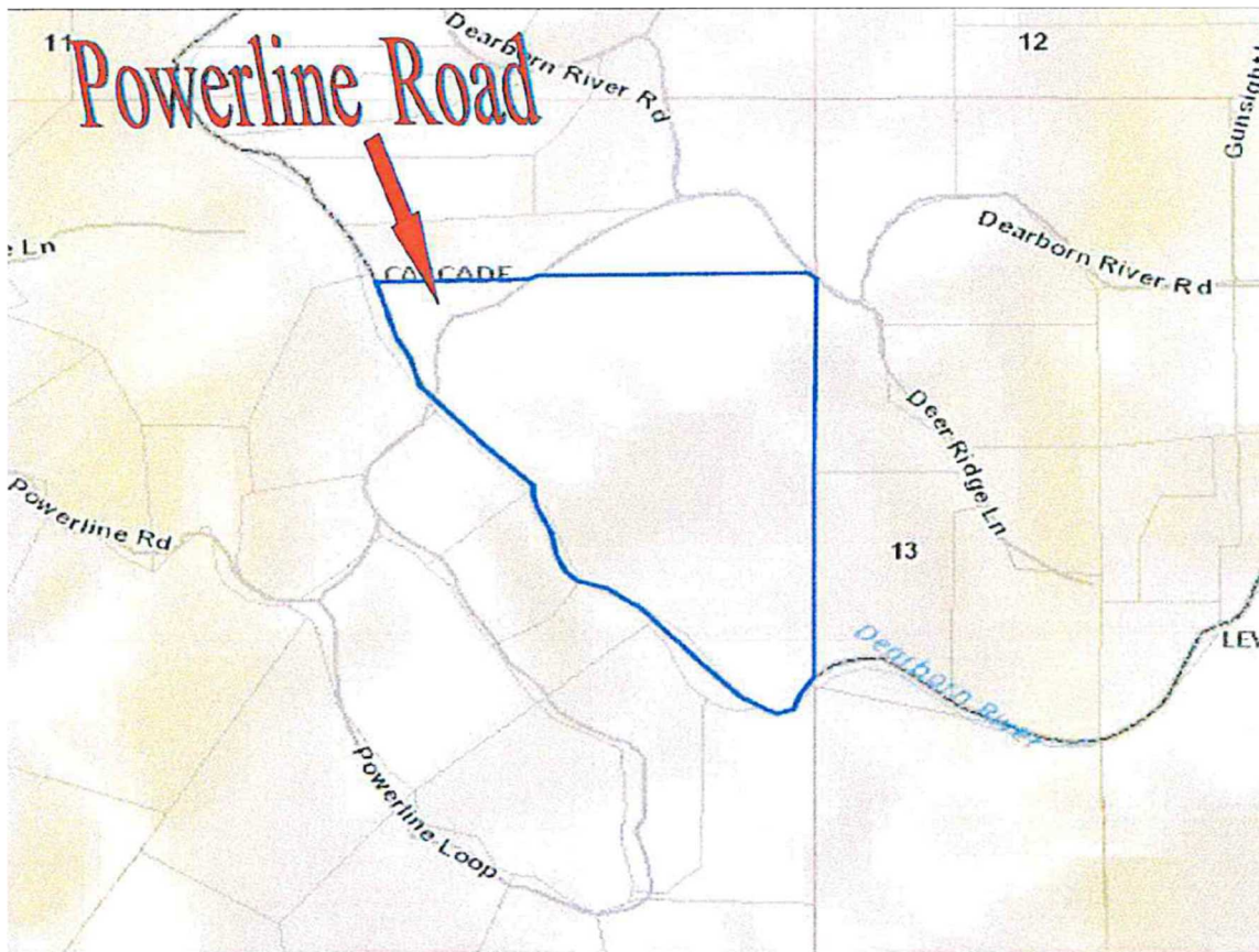
Figure 2: 2017 Montana Cadastral image identifying JRN’s Property; Annotations added by the DMLOA and included in its Motion and Brief for Summary Judgment