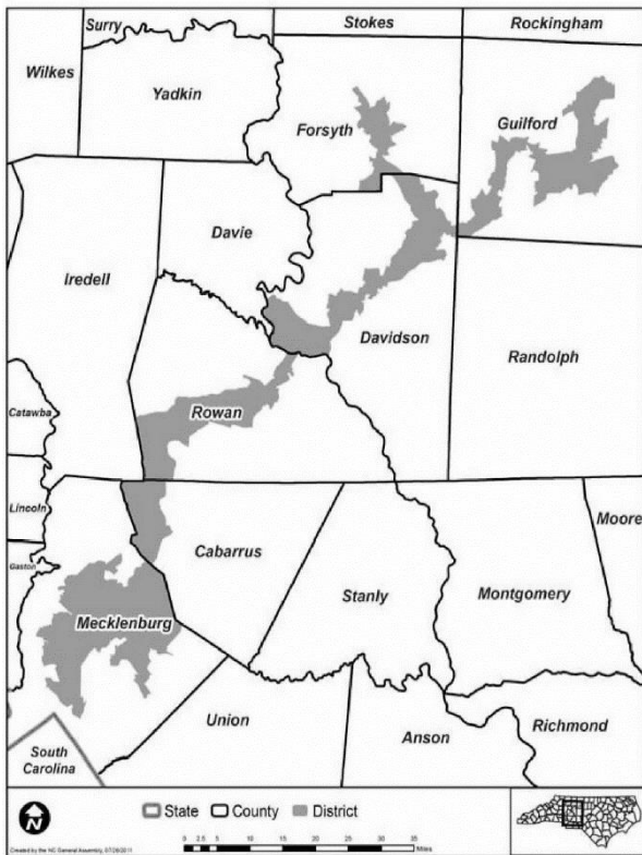
Congressional District 12 (Enacted 2011)

¶121 The United States Supreme Court described Congressional District 1 as "anchored in the northeastern part of the State, with appendages stretching both south and west[.]" Id. at 1456. It described District 12 as "zig-zagging much of the way to the State's northern border." Id. District 1 had a BVAP of 52.7% and District 12 a BVAP of 50.7%. Id. at 1466. Based on direct statements from a North Carolina Senate debate, the Court noted the map drawers had purposefully designed District 1 to hit "the 50%-plus target," which "had a direct and significant impact" on the district's configuration. Id. at 1469 (citation omitted). This change was not necessary because, notwithstanding a lower BVAP, for twenty years District 1 had